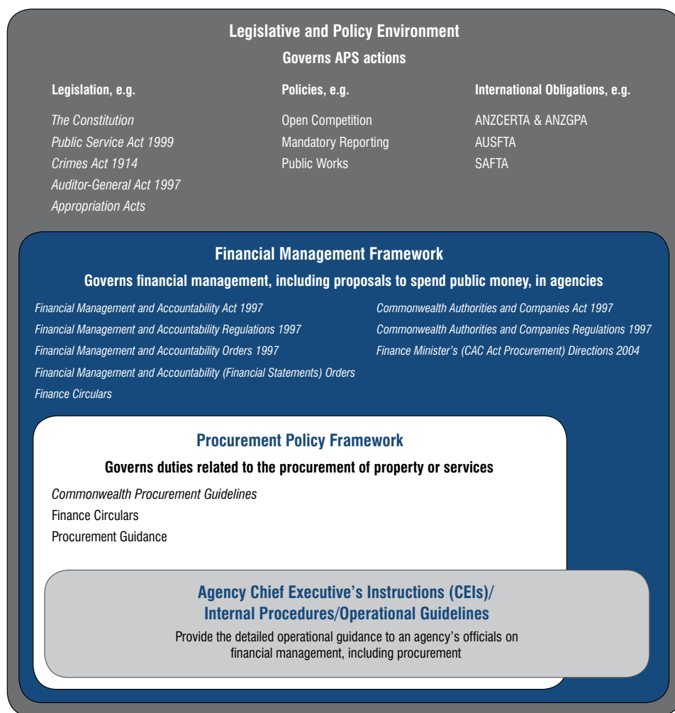
Figure 1 Chief Executive's Instructions build on the procurement and financial management frameworks and the policy and legislative environment and provide operational guidance focussing on the agency's particular needs.